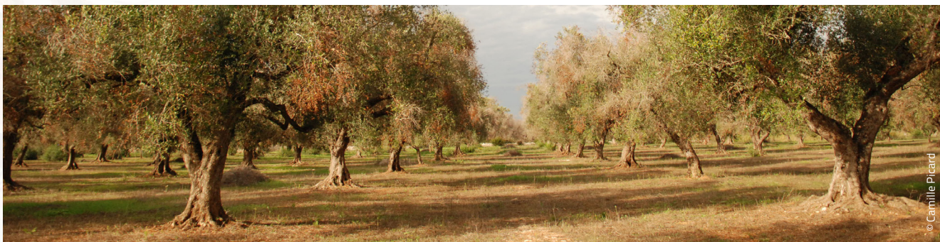
Figure 4 – Xylella fastidiosa responsible for the olive quick decline syndrome (OQDS) in the province of Lecce, 2015.