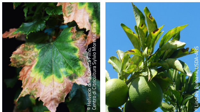
Figure 3 – First one. Pierce's disease of grapevine; Second one. Citrus variegated chlorosis.

Managing the disease in the field is very difficult due to the complexity of hosts and vectors. The most effective actions to be taken against the disease include: prevention and/or containment measures such as the use of 'healthy' propagating materials, early surveillance and detection of the pathogen, the destruction of infected plants and vectors control strategies. Some agronomical practices may be effective in containing the disease, such as the pruning of symptomatic twigs/branches in citrus showing Citrus variegated chlorosis at early stages.